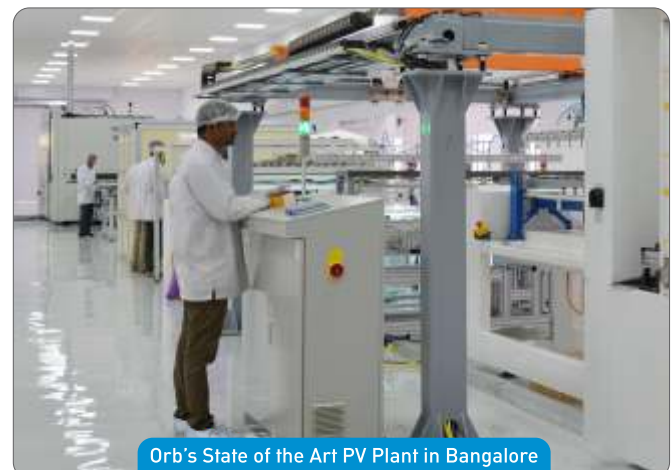
Orb's State of the Art PV Plant in Bangalore

Call us: + 91 9900520505 Email: sales@orbenergy.com Web: www.orbenergy.com Orb Energy, 95 Digital Park Road, 2nd Stage, Yeshawanthapura, Bangalore 560022, India