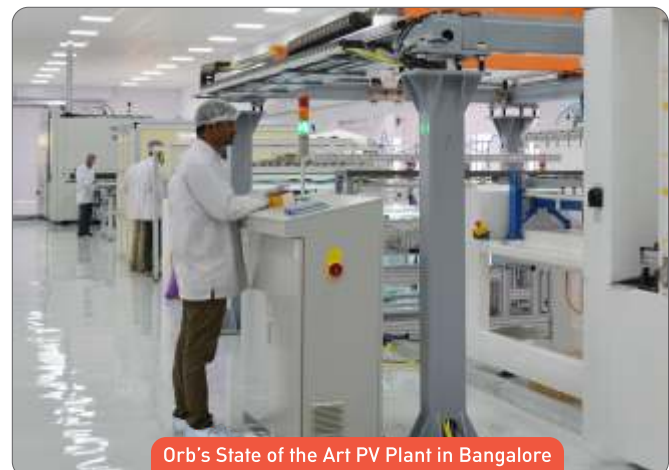
Orb's State of the Art PV Plant in Bangalore

Call us: + 91 9900520505 Email: sales@orbenergy.com Web: www.orbenergy.com