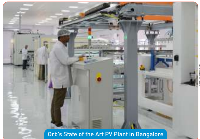
Orb's State of the Art PV Plant in Bangalore