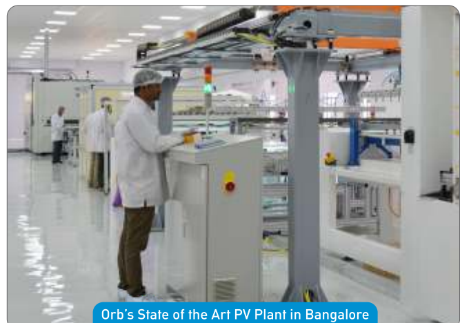
Orb's State of the Art PV Plant in Bangalore

Call us toll free 1 800 3010 1650 Email: sales@orbenergy.com Web: www.orbenergy.com Orb Energy, 95 Digital Park Road, 2nd Stage, Yeshawanthapura, Bengaluru 560022, India