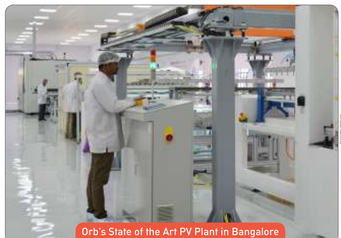
Orb's State of the Art PV Plant in Bangalore

Call us toll free 1 800 3010 1650 Email: sales@orbenergy.com Web: www.orbenergy.com Orb Energy, 95 Digital Park Road, 2nd Stage, Yeshawanthapura, Bengaluru 560022, India