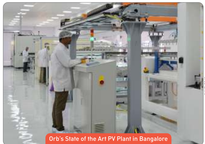
Orb's State of the Art PV Plant in Bangalore